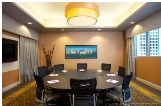
Need a meeting room? No problem.