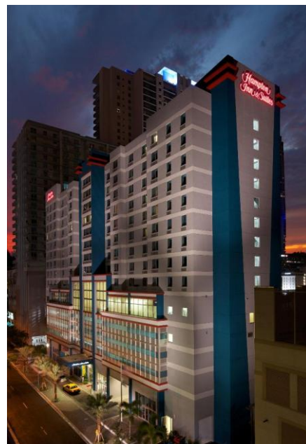
Another perk: Free hot breakfast daily

For reservations, call 305-377-9400 or go to HamptonInnMiamiBrickell.com . (Also, check out the deal for Florida residents!)