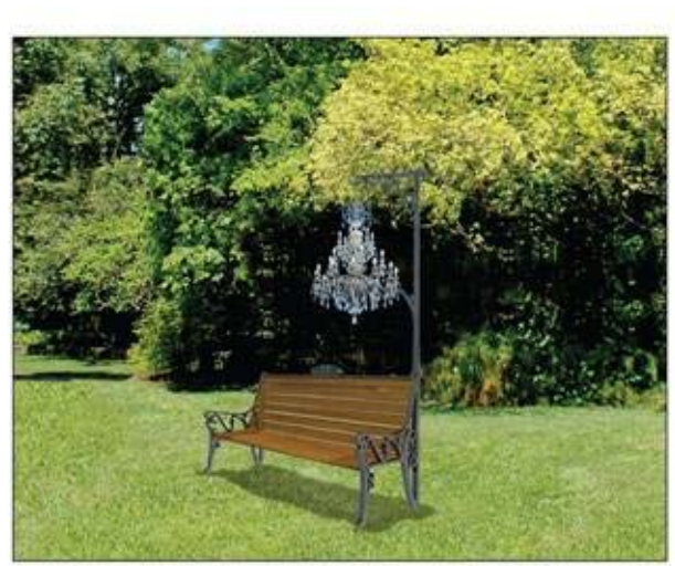
Opening Dec. 4, Sitting Naturally places 14 creatively modified benches throughout the Garden.